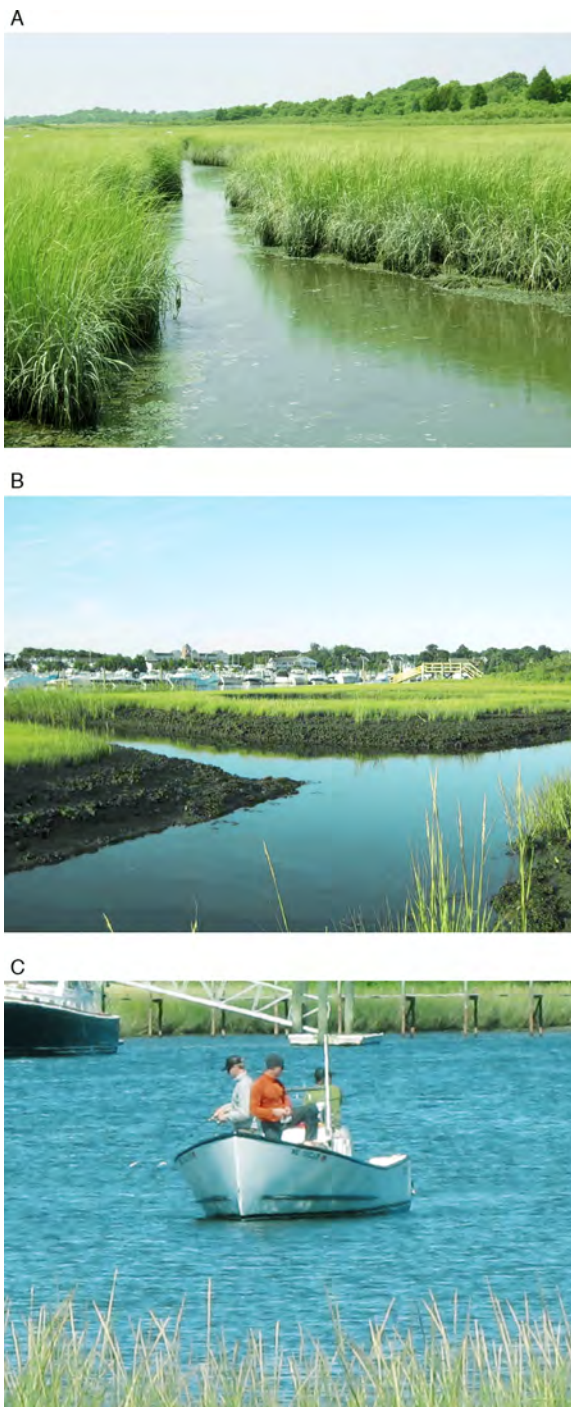
FIG. 1. Representative photos of (A) vegetated and (B) die-off salt marshes, and (C) recreational fishing at a study site in Cape Cod, Massachusetts, USA. At vegetated marshes without localized fishing pressure, cordgrass, Spartina alterniflora , extends to the water's edge at low tide. At marshes with recreational fishing activity, Sesarma crabs have consumed vegetation in the low intertidal, leaving expansive die-offs along the marsh margin.