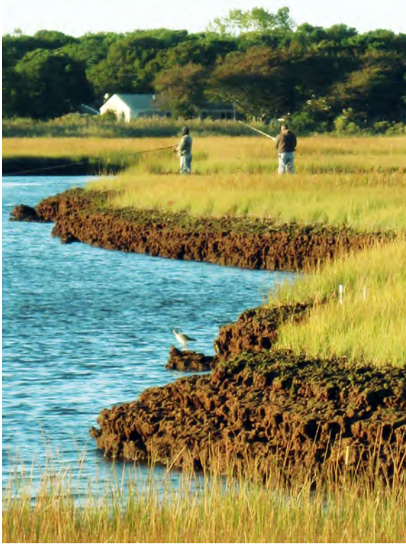
PLATE 1. Two recreational anglers fishing from the bank of a marsh that is unvegetated and crumbling at their feet into the creek. A trophic cascade links this fishing activity with the collapse of salt marsh vegetation because the removal of predatory fish and crabs by anglers allows the population of herbivorous Sesarma crabs to proliferate, and those crabs in turn clear-cut the marsh vegetation.

Our results establish a large-scale association between recreational overfishing and salt-marsh die-off and provide the first evidence connecting the local depletion of top predators with salt-marsh die-off. This suggests that overfishing may be a common mechanism underlying trophic-level dysfunction (Steneck et al. 2004), where predator populations are below the functional threshold where they can control herbivores, driving the epidemic of salt-marsh die-off throughout the western Atlantic. More generally, our study is among the first to provide evidence that localized predator depletion can generate shifts in marine community structure and dynamics (Eriksson et al. 2009), and it supports an emerging perspective that predator depletion can lead to rapid collapse of coastal ecosystems and the services they provide (Worm et al. 2006). Our experimental results compliment other studies examining the impacts of predator depletion on coastal marine ecosystems as inferred from either historical trends (Estes et al. 1998, Jackson et al. 2001, Frank et al. 2005, Lotze et al. 2006, Daskalov et al. 2007, Myers et al. 2007) or the implementation of no-take areas where changes in intermediate- and basal-trophic levels are attributed to